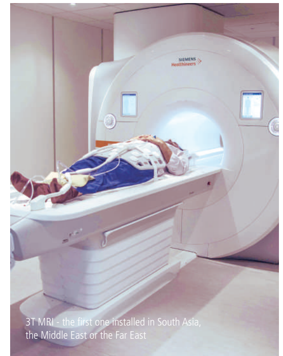
3T MRI - the first one installed in South Asia, the Middle East or the Far East