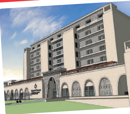
Karachi Completion Date - 2021