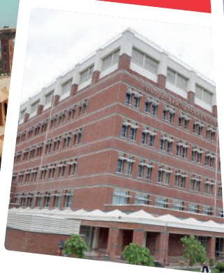
Peshawar - 2015