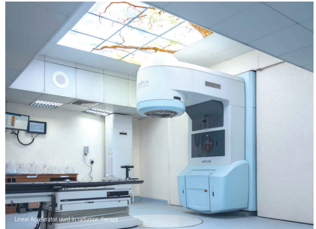
Linear Accelerator used in radiation therapy