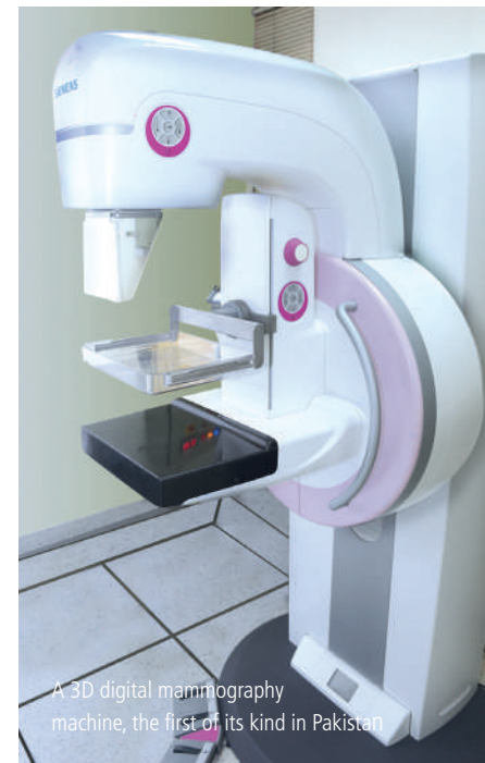
A 3D digital mammography machine, the first of its kind in Pakistan