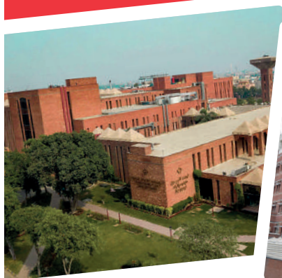
Lahore - 1994

We are increasing our fight against cancer