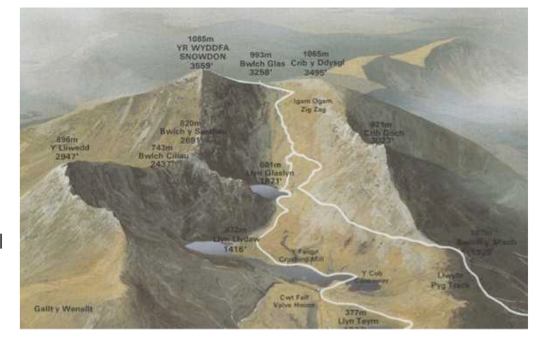
A snapshot of what to expect for the Pyg Track, Snowdon

Our ascent will be through Pyg Track and we'll follow the Miner's Track on our descent.